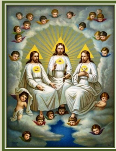
The Blessed Trinity

BEFORE THE ending of the day, Creator of the world, we pray That with Thy wonted favor Thou Wouldst be our guard and keeper now. FROM ALL ill dreams defend our eyes, From nightly fears and fantasies;