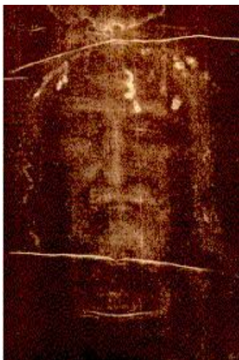
The Holy Face of Our Lord Jesus Christ