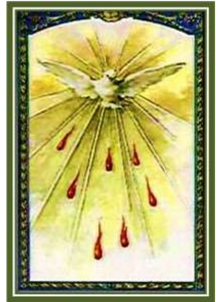
THE HOLY GHOST and HIS 7 GIFTS