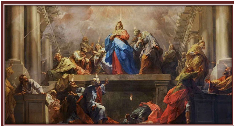
Meditations on the Third Mystery of The Glorious Mysteries, 'The Descent of The Holy Ghost' (From: "How to Pray Your Rosary", by St. Louis Di Montfort)

Paternoster... Ave... Gloria... (7X), Act of Oblation, Prayer for the Seven Gifts