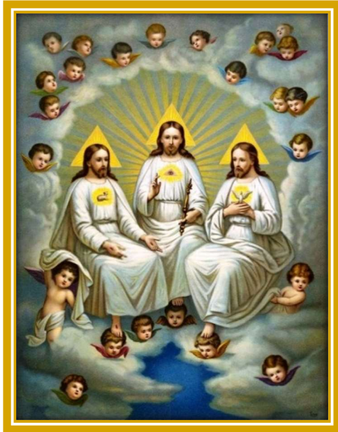
THE BLESSED TRINITY

(Start FRIDAY after THE ASCENSION to WHITSUNDAY EVE)